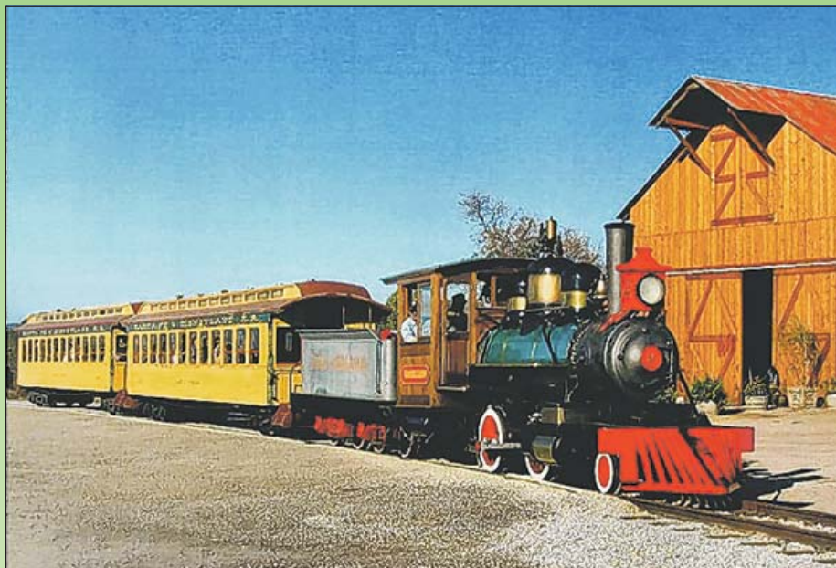
The first-ever Central Coast Railroad Festival is Oct. 8 to 12. Events and activities will be held at rail-related locations throughout the county. Details: (805) 773-4173, ccrrf.com .

Visit the Calendar of Events on www.SanLuisObispoCounty.com .