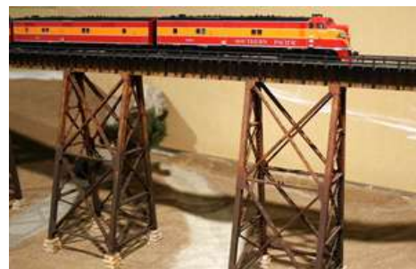
Thanks to Gary See for these photos from the 2017 Central Coast Railroad Festival.